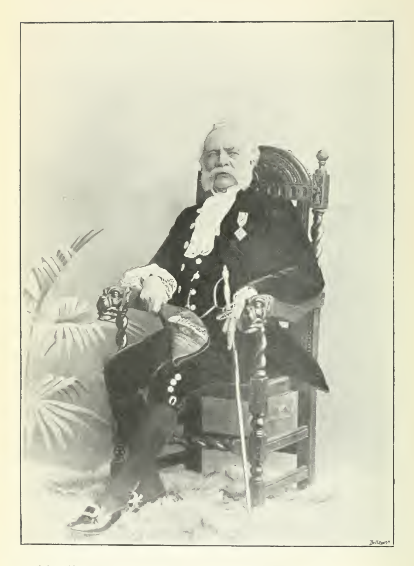
RIGHT HON. THE LORD MAYOR OF MAN: HESTER, 1897. (J. FOULKES ROBERTS.)